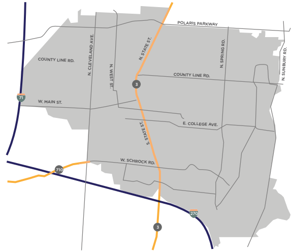
City of Westerville

The Central Ohio Transit Authority (COTA) runs a bus rapid transit system called CMAX, with direct routes connecting Westerville to downtown Columbus. COTA//Plus provides on-demand curb-to-curb mobility services. GoHio Commute offers ridesharing and emergency ride home options.